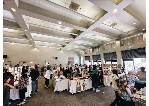
Bunka-Sai was held on April 15 th and 16 th , 2023 at Ken Miller Recreation Center