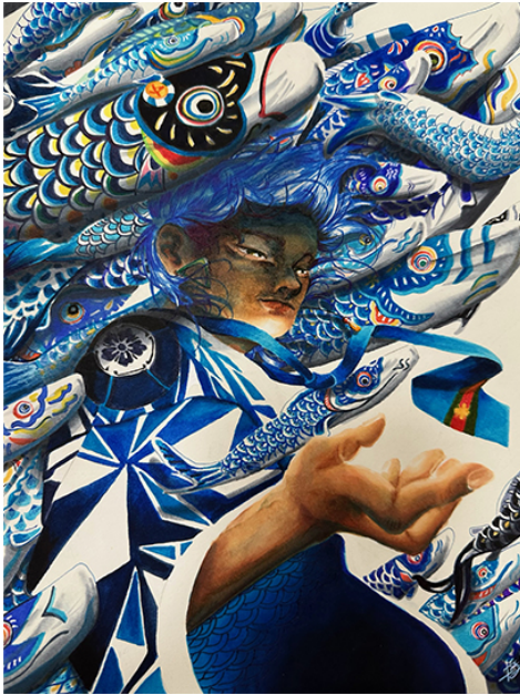
First Place : Erika N.