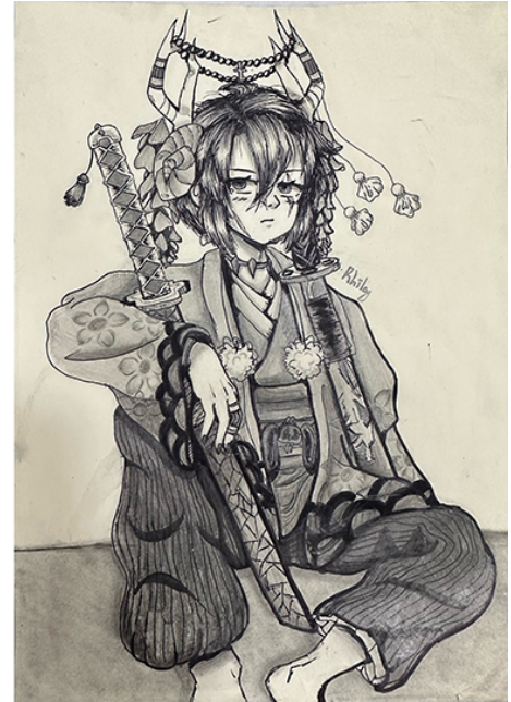
First Place : Rhiley P.