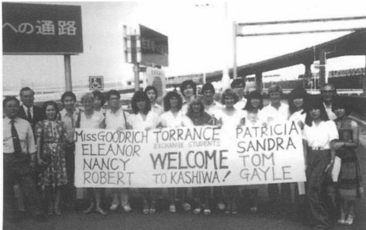
The 1981 delegation received a royal welcome in Kashiwa.