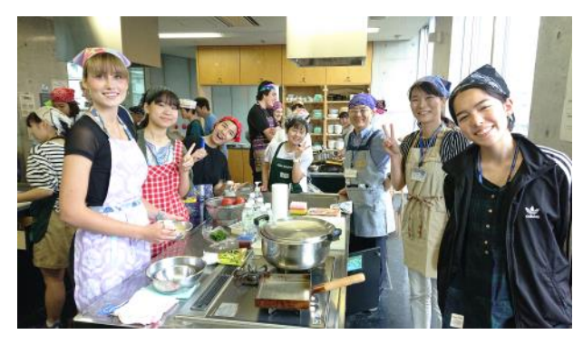
2019 TSCA Delegates enjoy a cooking lesson in Kashiwa

(You can use liquid from canned fruit to thin out the tapioca if desired).