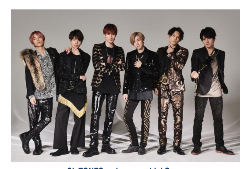
SixTONES, a Japanese Idol Group

The music has wonderful power, because if we use the music, we can make our own style of language. For example, outside of Japan, other country's people can understand. I want to be a person who connects Japanese people and people from around the world. #