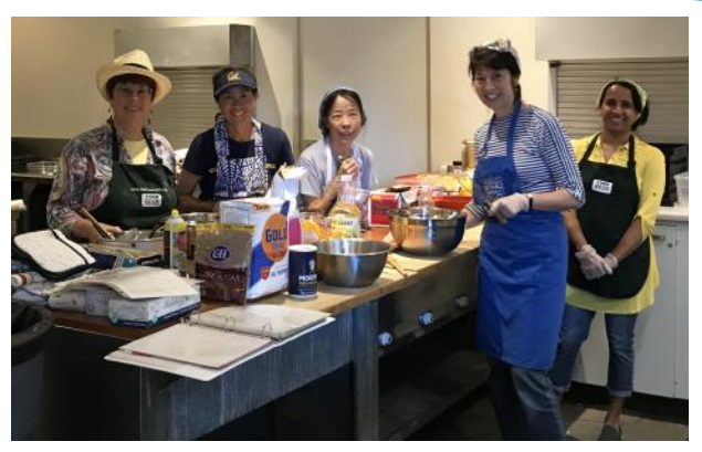
Bunka-Sai Mochi Making Team