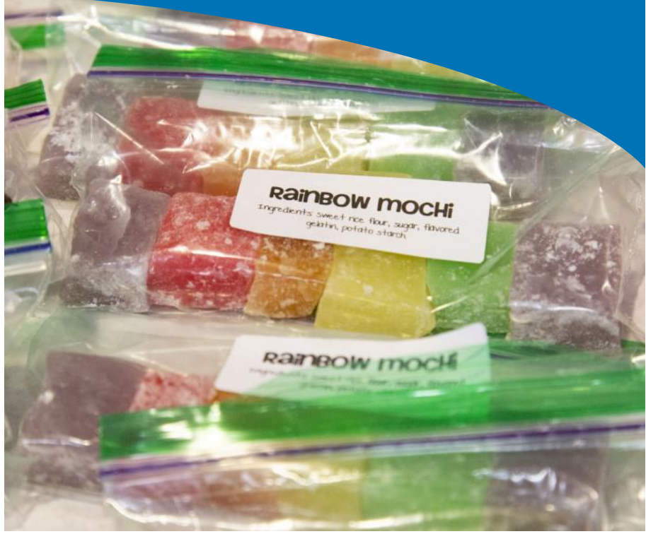
Rainbow Mochi sold at Bunka-Sai.