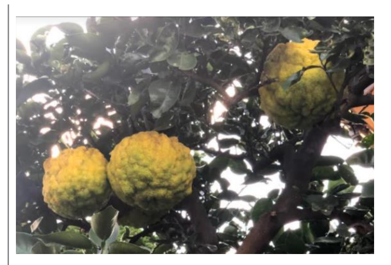
Yuzu fruit tree

The thing about living in a foreign country is that every little moment of every single day is exciting and new. My typical day goes like this. I wake up, walk to the nearest hanbaiki, or vending machine, to buy a 100 yen warm corn soup in a can, and head out to explore. I notice little things on my walk- the enormous palm-sized spiders in every bush, fresh yuzu hanging from my neighbors' trees, and the river next to my apartment filled with fishermen, fish, swans, and ducks. For lunch, I go to a ramen shop filled with businessmen ALL reading manga as they eat. I walk throughout Kashiwa, a perfect suburbia for food and