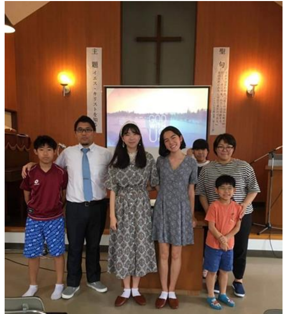
Attending Sunday service at a local church in Kashiwa.

community for the Christian preschool they run. On Sunday, parents of the preschool children and other Christians in the neighborhood gathered in a chapel above the school for Sunday service. After we sang a few Japanese hymns, the pastor shared a very in-depth and structured message about the 12 disciples. Following the Sunday service, the pastor was kind enough to answer some questions I had about the coexistence of Buddhism, Shinto, and Christianity in modern Japanese society. He touched on various aspects of religious thought in Japan, including sakoku (a 200-year period in which Japan closed itself off from all foreign religious influence), and Japan's collectivistic culture, which emphasizes group goals, tradition, and conformity. He accredited sakoku and the collectivistic culture to the preservation of ancient Buddhist and Shinto traditions throughout generations, and hypothesized that they might also be a reason as to why foreign religions such as Christianity have believers in less than 1% of the Japanese population.