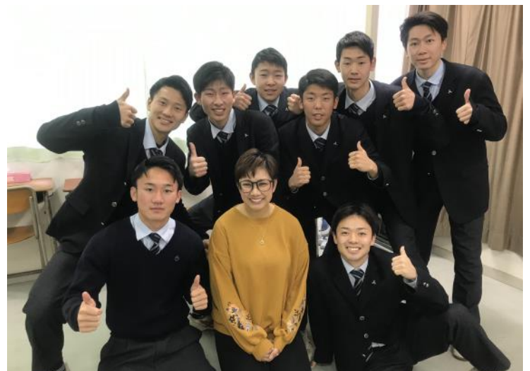
Ichikashi 3H Class Photo

January always comes in with a rush, but time finds a way to slow down as it ushers in the next month. I just hope that the rest of this year goes by slowly, though I know that's rarely the case when you're having as much fun as I am every day. ☘