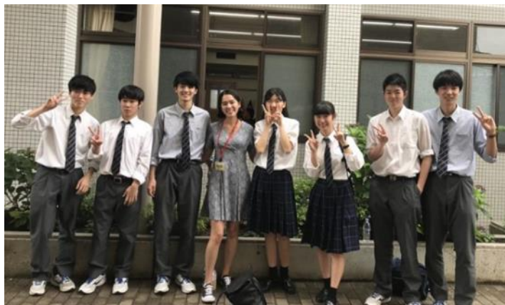
Attending class at a Buddhism-affiliated high school in Tokyo

On the second free day, my host family took me to attend Sunday service at a local Christian church called Nihon Baptist Kashiwa Kyokai. This church was very unique because they were known and appreciated by the