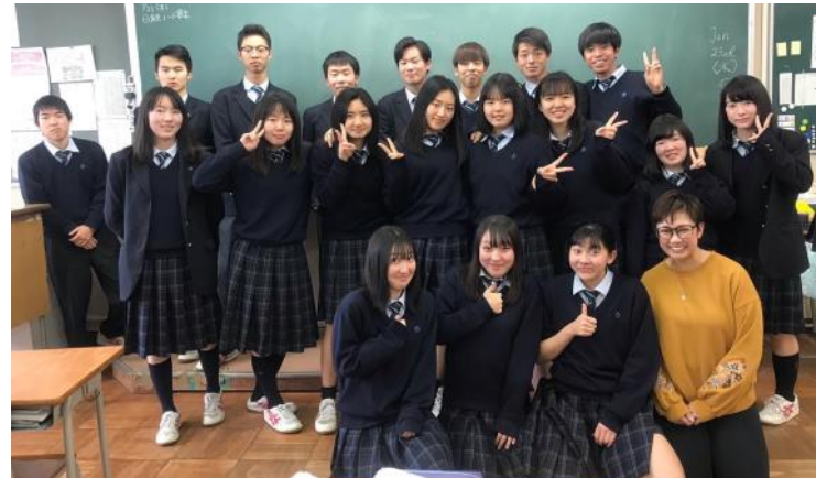
Ichikashi 3A Class Photo

As for school life, after returning from winter break, the students at Ichikashi seem more refreshed and lively. They've come out of hibernation, and they're ready for the end of the year. For the third year students - equivalent to seniors in US high schools - that ending will come sooner for them than the rest of their underclassmen. Their classes quickly draw to a close only one month into the new term, and they've got the rest of February off to