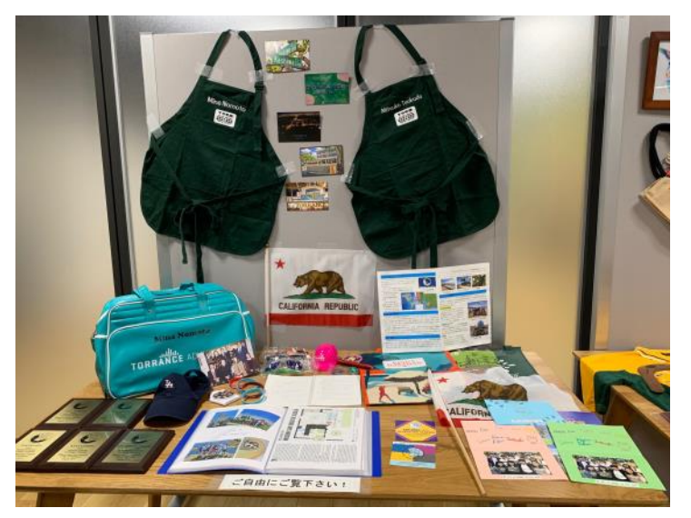
Torrance booth decorated with memorable Torrance goods.