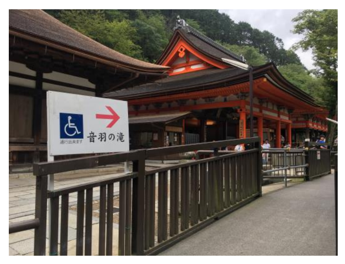
Handicap accessible mobility ramp at a tourist attraction.

I noticed that Japan has provided the most accommodations for the visually impaired. A notable accommodation for people with visual impairments is yellow tactile paving on sidewalks and platforms which serve as guiding paths. These are called Tactile Ground Surface Indicators (TGSI). These raised lines and bumps guide visually impaired people safely to their destinations (such as the train, bus, or elevator). Other accommodations for people with visual impairments include braille on toilet controls, ATMs, and elevators, as well as Accessible Pedestrian Signals (APS) at intersections which play a melody or chirps when the walk sign is active.