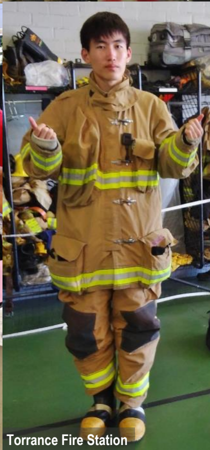
Torrance Fire Station