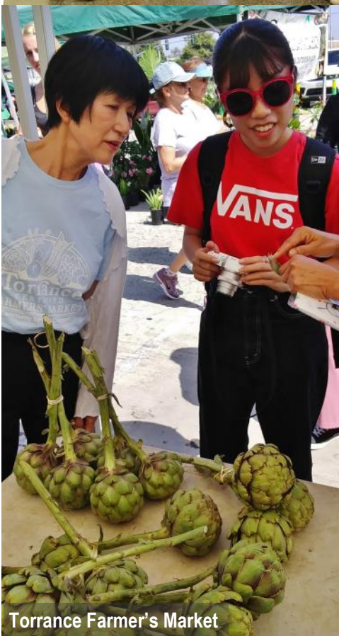
Torrance Farmer's Market