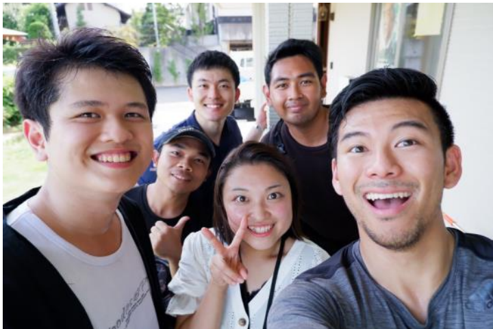
Kashiwa Exchange Youth Society

Laughter followed as we became more acquainted with each other and we went outside under the beautiful summer skies to get started. We poured cups of “tsuyu,” a mixture of dashi (soup stock), soy sauce, mirin , and sugar. We also had wasabi (green horseradish), karashi (mustard) or green onions for an extra kick. We cooked the noodles, connected the water to the bamboo, and called everyone to gather around. It takes a combination of patience, skill, and a little bit of luck to be able to catch the noodles.