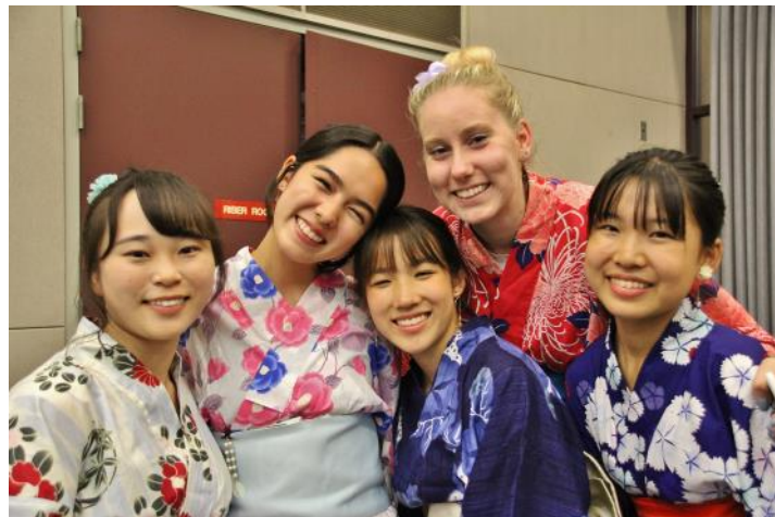
KIRA and TSCA Student Delegates