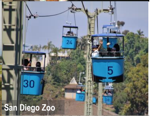
San Diego Zoo