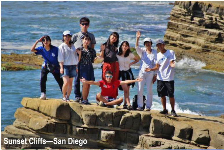
Sunset Cliffs—San Diego