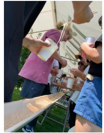
KEYS Nagashi Somen Event

Our foreign guests were ecstatic to be able to experience such a rare treat. For many of our Japanese students, it was their first time as well! However, my excitement exceeded the students. I’ve only seen Nagashi Somen in dramas and animes, and I couldn’t believe that I got the opportunity to not only try nagashi somen, but to help set up an event for others to enjoy.