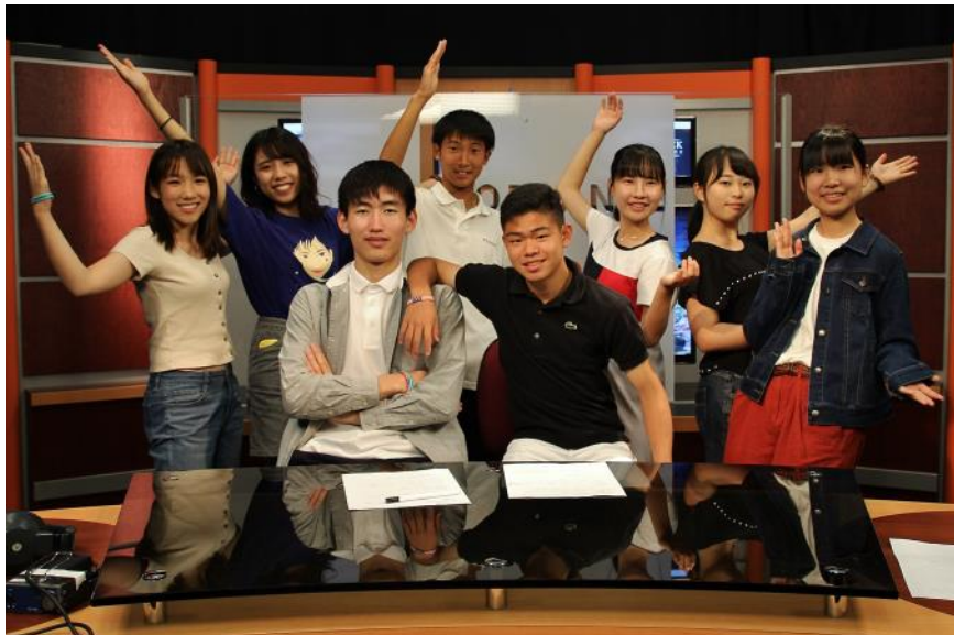
KIRA 2019 Student Delegates at CitiCABLE

Check out https://www.torranceca.gov/cable for more information and view broadcasts online at CitiCABLE’s YouTube Channel . ☞