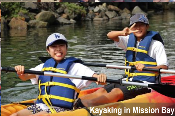
Kayaking in Mission Bay