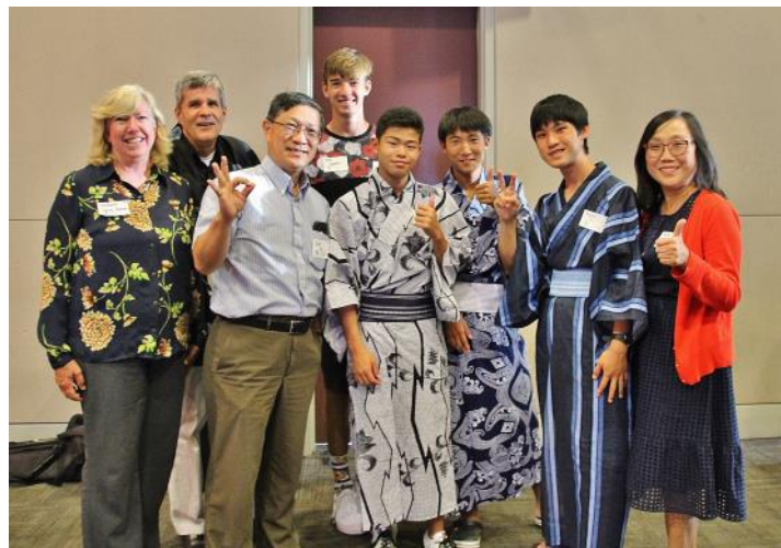
Host Families and Students

heard: "Torrance is a great city, and I want to come back someday."