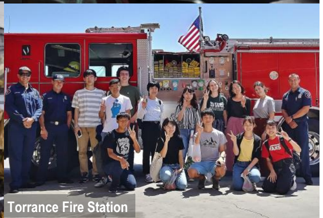
Torrance Fire Station