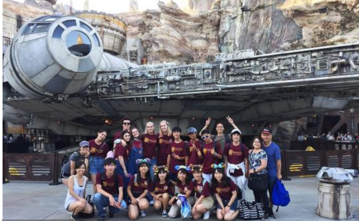
Star Wars: Galaxy's Edge at Disneyland