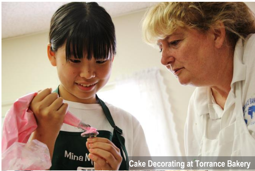
Cake Decorating at Torrance Bakery