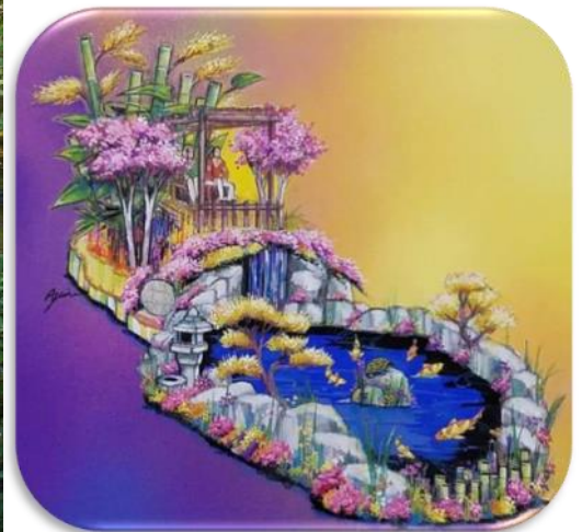
Our Garden of Hopes and Dreams