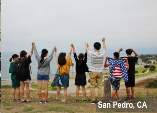
San Pedro, CA