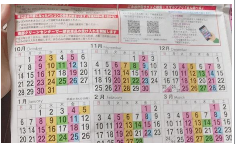
Garbage collection calendar for Kashiwa. Each color represents a different waste category.

In Kashiwa, there are various different categories to sort trash into: recyclables, hazardous waste, plastic containers and packaging, burnable and non-burnable garbage, as well as green waste. For each category, there is a specific way that they should be presented on their given pick up days. For example, paper, cardboard, and used clothes must be separate, held together with string, and put out every other Thursday.