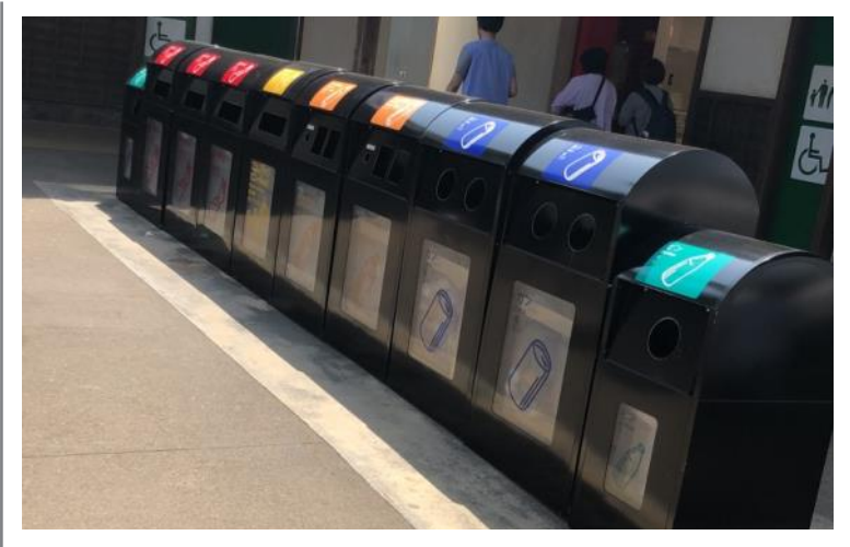
Public waste sorting bins

Even though separating recyclables is a lot of work, there are many benefits. The recyclables are very profitable because they increase the amount of products that are made from recycled materials, which decreases the amount of energy spent on harvesting raw materials needed to make the same product, and the amount of trash that goes to incinerators and landfills.