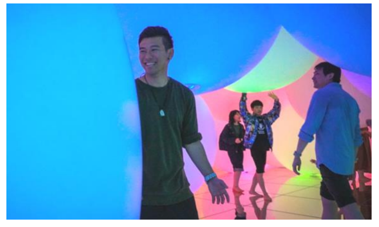
Team Lab Digital Art Museum in Odaiba

The Team Lab Digital Art Museum was an experience that left me speechless and in a daze. It was absolutely mesmerizing to witness how far technology has come. They mix sounds with visual projections and guests are transported to another dimension. There is one exhibit where you enter a room full of water that goes up to your knees while a spectrum of colors and flowers and koi fish are projected all around by high tech equipment.