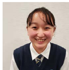
11 th Grade Shibaura Institute of Technology Kashiwa High School