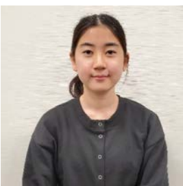
11 th Grade Shibaura Institute of Technology Kashiwa High School