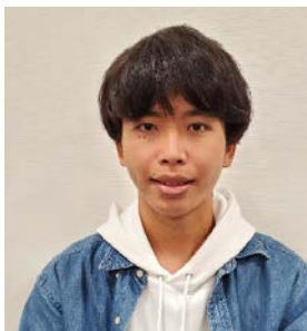
Sophomore Keio University