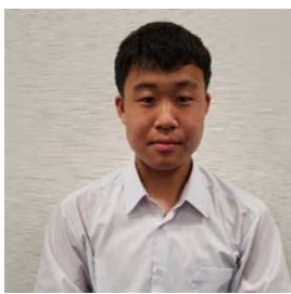
11 th Grade Kashiwa High School