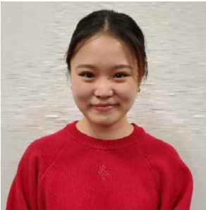
Sophomore Juntendo University