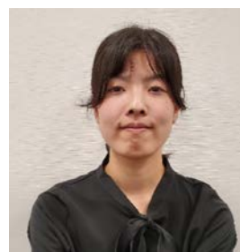
Freshman Keio University