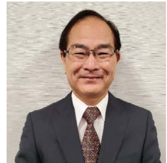
Adult Leader Member of KIRA