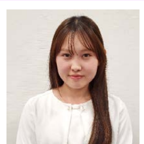
Freshman Sophia University