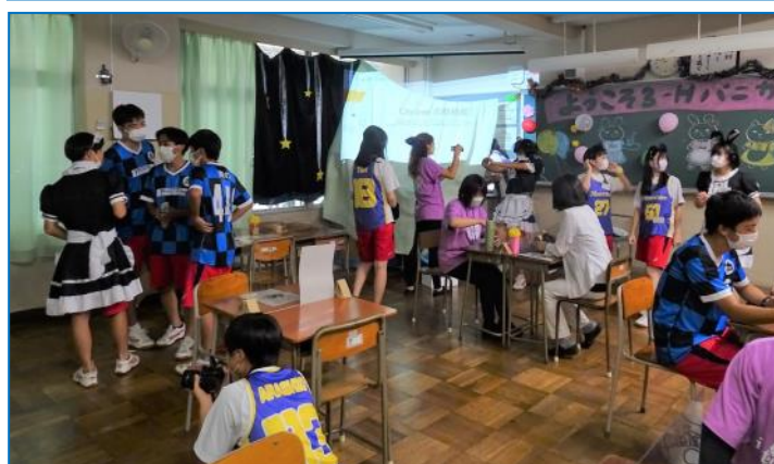
Top: The most innovative attraction was the Toy Story Mania ride, made by the 3rd-year students. Bottom: The Maid Café was a common theme. The cuteness or "kawaii" aspect was present in all the class attractions.

As I reminisced after that weekend, I couldn't help to think if our schools had that type of event. I remembered that we had school rallies, dances, back-to-school nights, and Springfest back home. However, it is hard to compare Bunka-Sai to those events . It's the beauty and charm of Bunka-Sai that makes this asset of school culture here so fascinating. There is this sense of camaraderie and unity that makes it feel so special. Every single person is involved in some way, shape, or form. It's creating these moments for our students to remember, and it's a reminder for us staff and faculty that there is always time for fun in our ever-so-busy lives. ☘