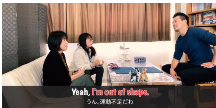
Yeah, I'm out of shape. うん、運動不足だわ