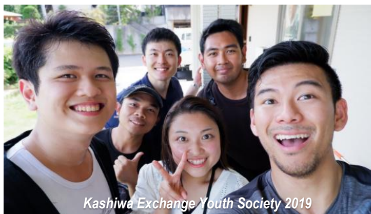
Kashiwa Exchange Youth Society 2019