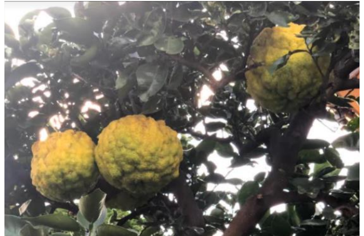
Yuzu fruit tree

The thing about living in a foreign country is that every little moment of every single day is exciting and new. My typical day goes like this. I wake up, walk to the nearest hanbaiki , or vending machine, to buy a 100 yen warm corn soup in a can, and head out to explore. I notice little things on my walk- the enormous palm-sized spiders in every bush, fresh yuzu hanging from my neighbors' trees, and the river next to my apartment filled with fishermen, fish, swans, and ducks. For lunch, I go to a ramen shop filled with businessmen ALL reading manga as they eat. I walk throughout Kashiwa, a perfect suburbia for food and