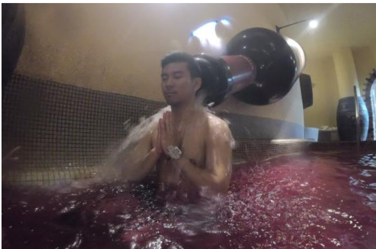
Yunessun Hot Springs in Hakone

Recently, I discovered a unique spot in a town called Hakone. Hakone is famous for its hot springs and beautiful green forests that stretches for miles. My friends and I drove over four hours, traveling along the scenic coast of Japan, and arrived at a hot spring amusement park called Yunessun. Visitors go into the amusement park with swimsuits and take a dip into something quite unusual. Guests can choose to bathe in a hot spring with red wine, coffee, green tea, or sake. This spa is very popular among families with children. There's even a pool where fish nibble at your feet. I definitely recommend this unique place for your next visit.