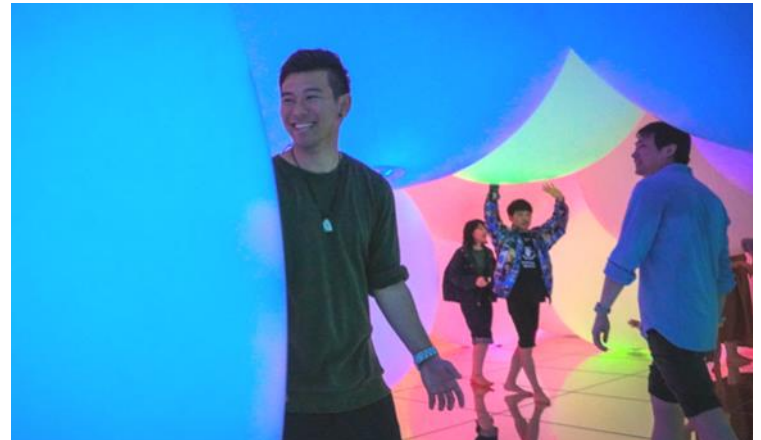
Team Lab Digital Art Museum in Odaiba

The Team Lab Digital Art Museum was an experience that left me speechless and in a daze. It was absolutely mesmerizing to witness how far technology has come. They mix sounds with visual projections and guests are transported to another dimension. There is one exhibit where you enter a room full of water that goes up to your knees while a spectrum of colors and flowers and koi fish are projected all around by high tech equipment.