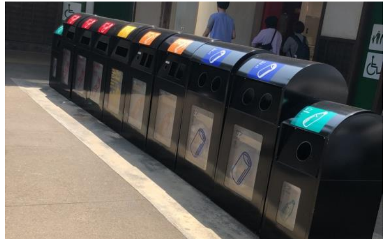
Public waste sorting bins

Even though separating recyclables is a lot of work, there are many benefits. The recyclables are very profitable because they increase the amount of products that are made from recycled materials, which decreases the amount of energy spent on harvesting raw materials needed to make the same product, and the amount of trash that goes to incinerators and landfills.