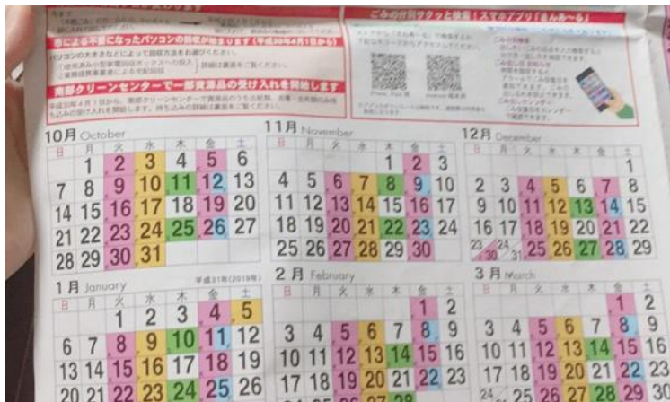
Garbage collection calendar for Kashiwa. Each color represents a different waste category.

In Kashiwa, there are various different categories to sort trash into: recyclables, hazardous waste, plastic containers and packaging, burnable and non-burnable garbage, as well as green waste. For each category, there is a specific way that they should be presented on their given pick up days. For example, paper, cardboard, and used clothes must be separate, held together with string, and put out every other Thursday.