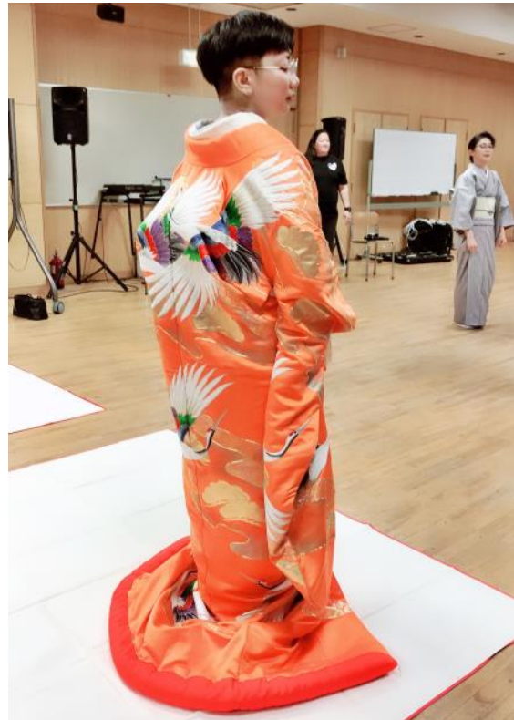
Modeling traditional wedding attire for the Ichikashi kimono instructors and NHS students

friends visiting and wanting to discover new places together, I'm able to relive that sensation. However, that isn't to say I don't love being a host to visitors. Without a moment to spare, I took a running start into the next event.